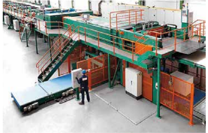
Converting and printing machines