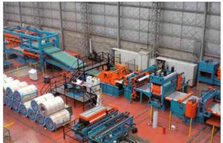
Metal processing lines